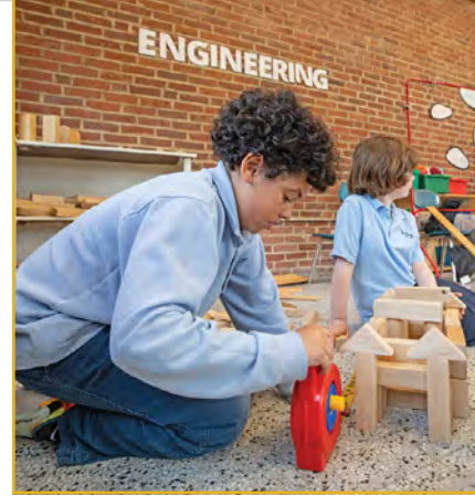
Children find a happy school environment at the Academy of Notre Dame in Tyngsboro, MA, founded in 1854, which educates children through pre-school, primary, elementary, junior high and high school in quality and individualized education.