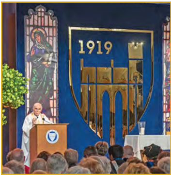
In 2019, Emmanuel College held a major Liturgy and Banquet to rejoice in the 100th Anniversary of Higher Education on the Fenway in Boston! Ad Multos Annos!

In 1891, the Sisters broke new ground by expanding beyond Massachusetts to open St. Teresa's in Providence, Rhode Island . By 1900, there were 32 Notre Dame Schools in New England . In each of the parishes where the Sisters taught, they were responsible for Religious Education as well as many pastoral duties. With the rising enrollment at the original Notre Dame Academy on Berkeley Street, the SNDdeN purchased land on The Fenway in Boston in 1912. This new building housed first Notre Dame Academy, Boston in 1914 .