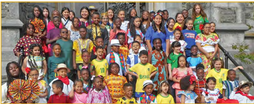
Faithful to the early Sisters, the Faculty and Children at St. Patrick School in Lowell, founded in 1852, celebrate their immigrant origins and their multi-cultures at specific times each year.

With the influx of Irish immigrants desperately seeking work, word spread to nearby cities of the success of those first Sisters at St. Mary's. In 1852 , the pastor of St. Patrick's Church in Lowell asked Sisters to open the next Notre Dame school. Those Sisters faced an enormous challenge. Most of the city's 11,000 Catholics worked in the local