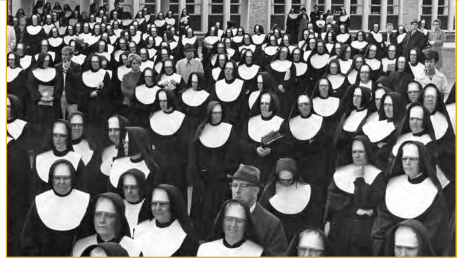
In 1965, hundreds of Sisters of Notre Dame de Namur celebrated the blessing and opening of the new Notre Dame Academy in Hingham, MA – the merger school of all our Academies founded in Boston and Roxbury (Lancaster and Berkley Streets, the Fenway, Roxbury and Grandby Street).